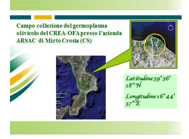
Figure 1. Geographic localization and absolute cordinates of the CREA–Research Centre for Olive, Citrus and Tree Fruit - World Olive Germplasm Collection, Mirto Crosia (CS), Italy.